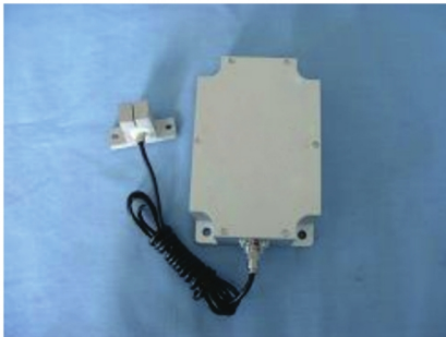
图 picture6 CY-050

CZ-049 peak impact vibration sensor is made with piezoresistive effect principle of semiconductor materials. The sensor can be widely used in impact and vibration measurement in aviation, spaceflight, and automobile industry, etc.